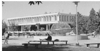
California State University, Fresno